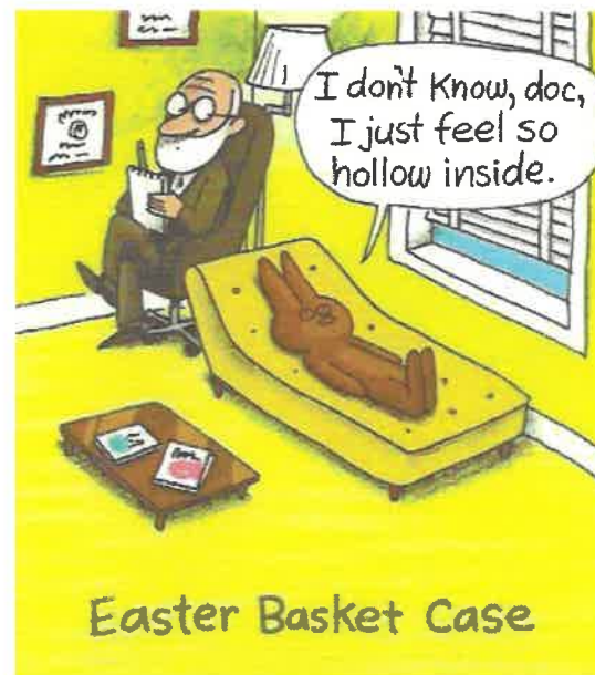
Easter Basket Case