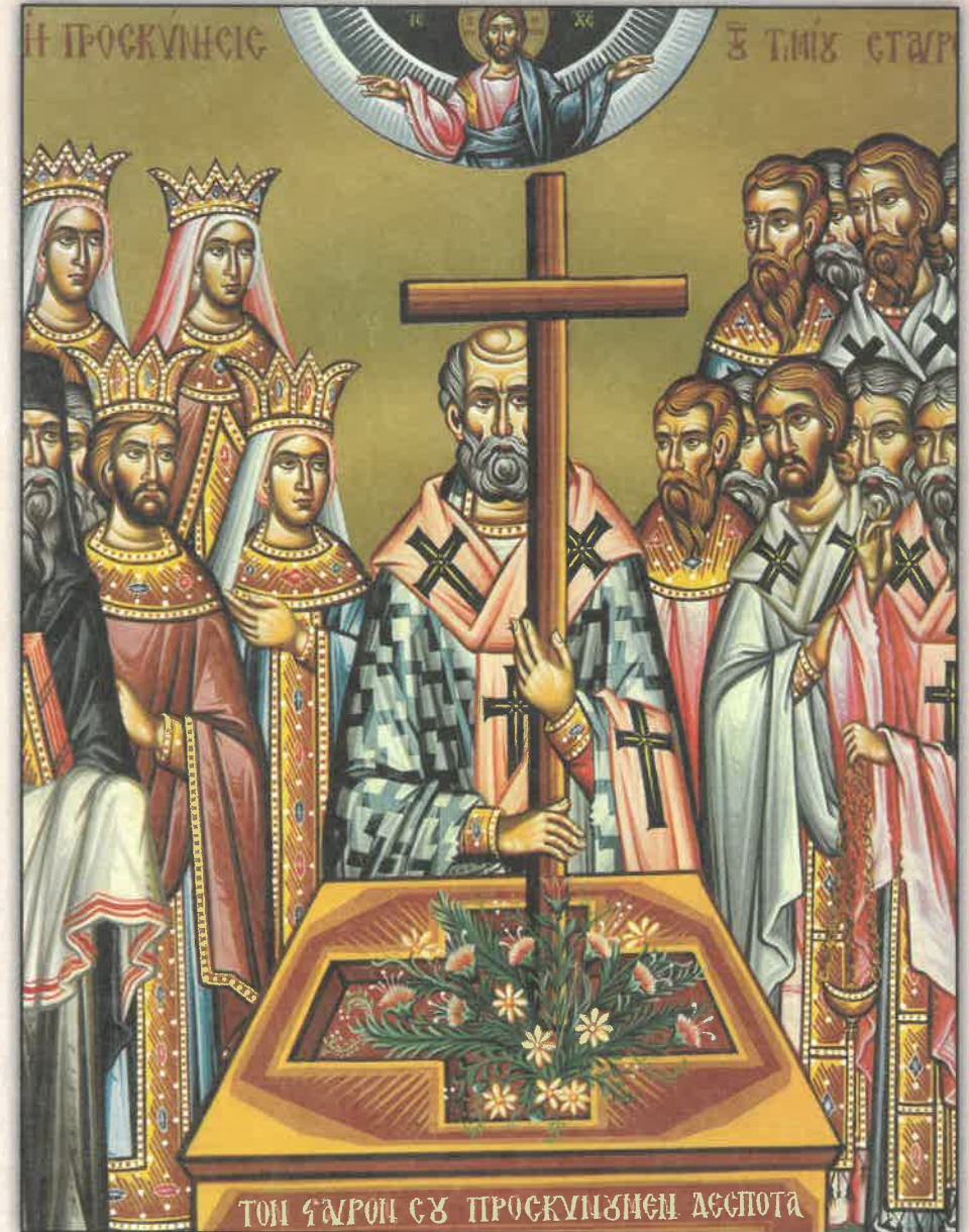
Icon of the Sunday of the Holy Cross