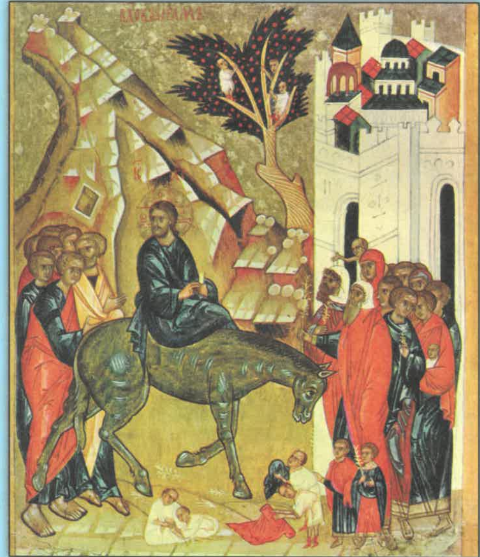
Icon of the Entrance into Jerusalem