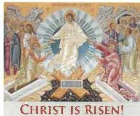
CHRIST IS RISEN!