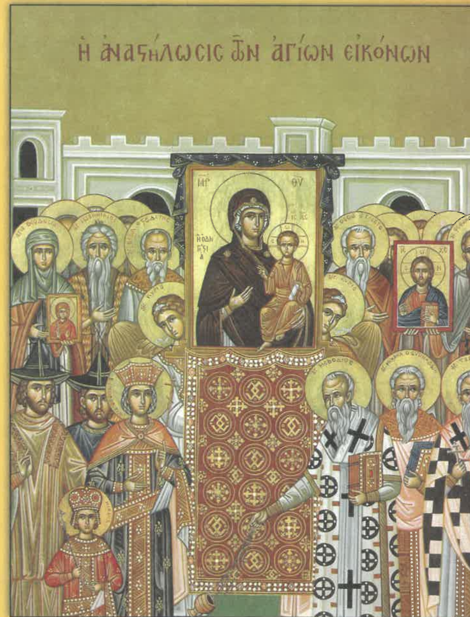
Icon of the Holy Images