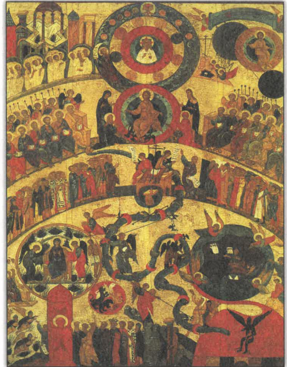
Icon of the Last Judgment