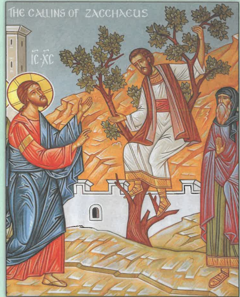
Icon of Christ and Zacchaeus (Luke 19:1-10)