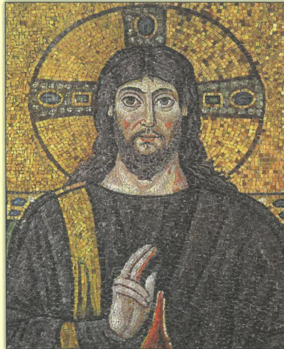
Icon of Christ Pantocrator