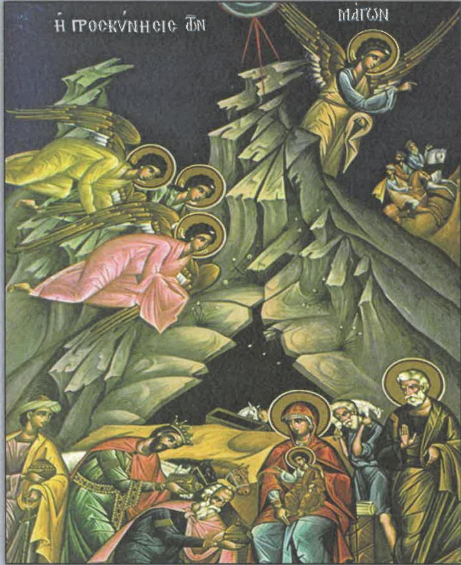
Icon of the Visit of the Magi