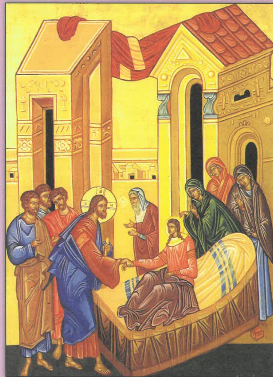
Icon of Raising the Daughter of Jairus