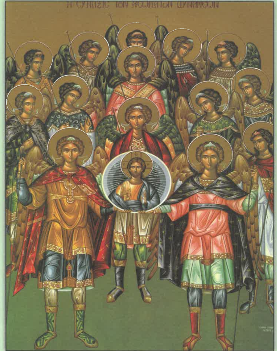
Icon of Saint Michael and all the Angels -- November 8th