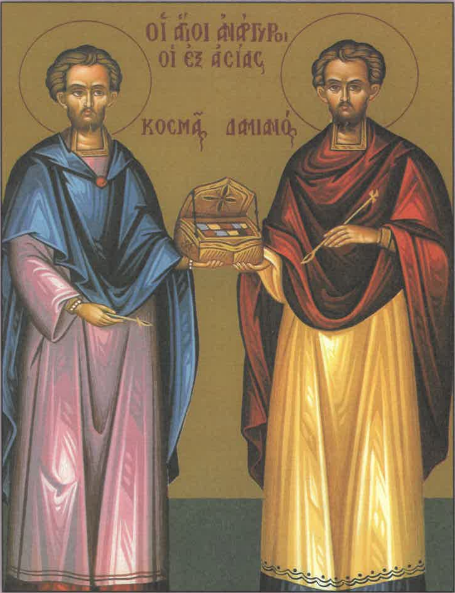
Icon of Saints Cosmas and Damian -- November 1st

At Aegeae in Cilicia, where they lived, they enjoyed the highest esteem of the people. When the persecution under Diocletian broke out, their very prominence rendered them marked objects of persecution. Being apprehended by order of Lysias, governor of Cilicia, they underwent various torments and were beheaded about the year 283. The three brothers of Cosmas and Damian, Anthimus, Leontius and Euprepiu, are said to have suffered with them. Among the distinguished people who attributed recovery from serious illness to Saints Cosmas and Damian was the Emperor Justinian I who built two churches in Constantinople in honor of the martyrs. Their basilica in Rome with its lovely mosaics was dedicated in the year 530.