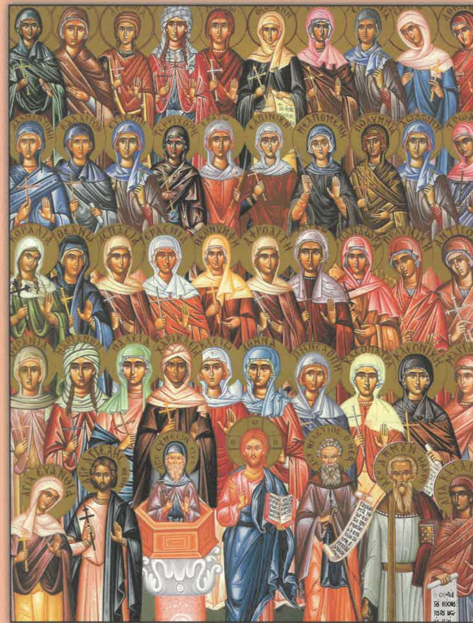
Icon of the 40 Women of Macedonia and Ammon -- September 1st