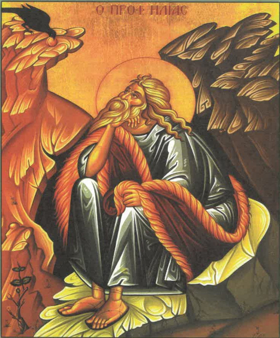
Icon of Saint Elias -- July 20th