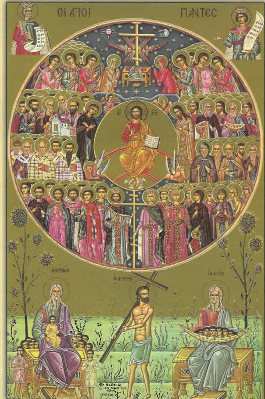
Icon of All Saints