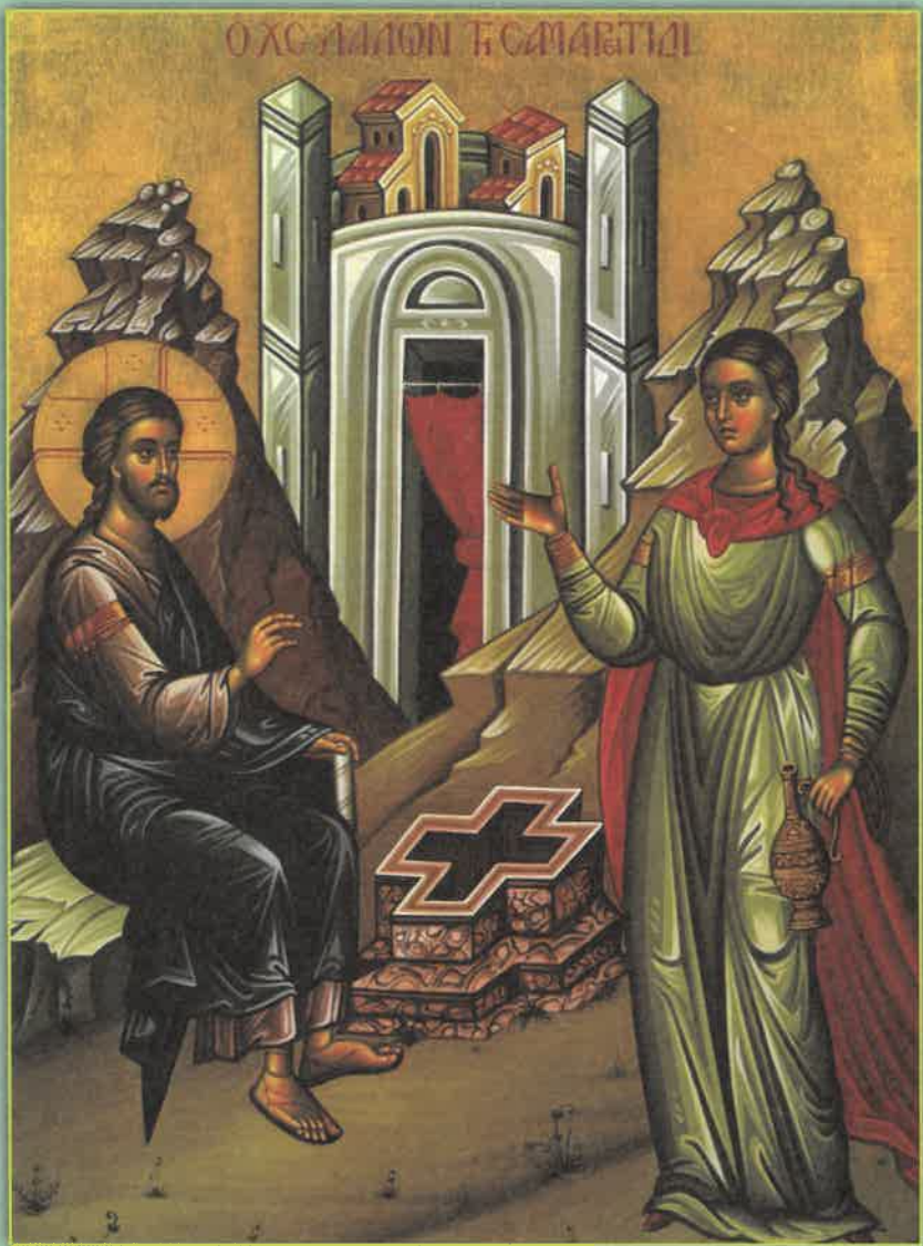
Icon of the Samaritan Woman