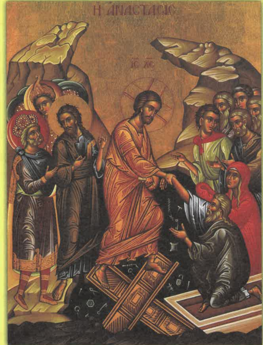
Icon of the Descent into Hades