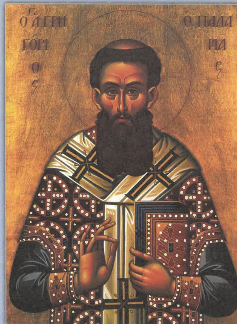
Icon of Saint Gregory Palamas