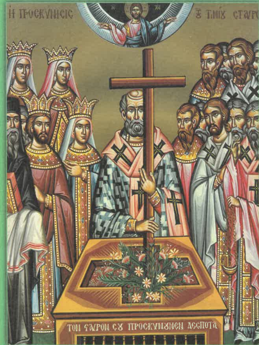
Icon of the Veneration of the Holy Cross