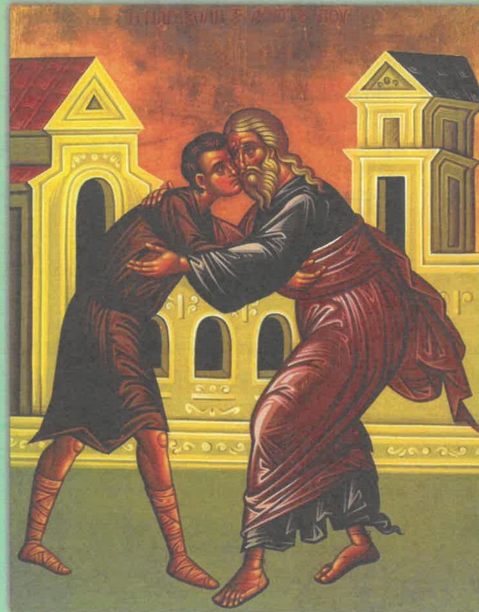
Icon of the Prodigal Son