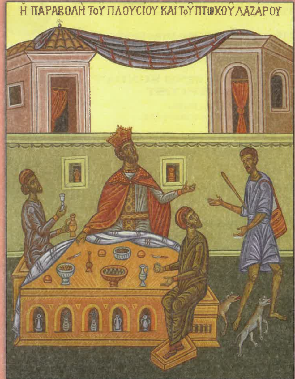
Icon of the Rich Man and Lazarus (Luke 16:19-31)