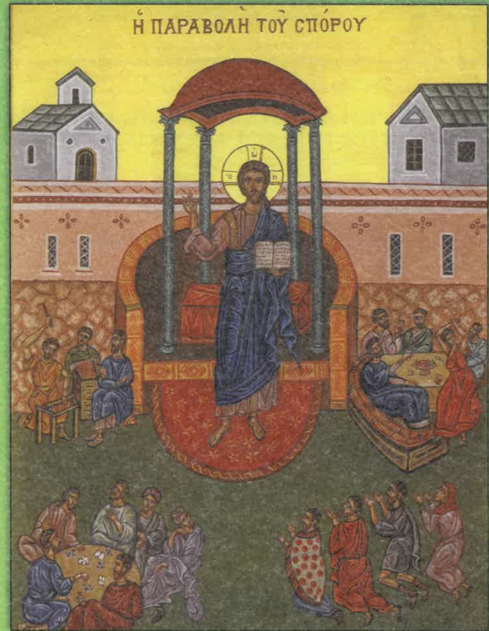
Icon of Christ as the Sower (Luke 8:5-15)