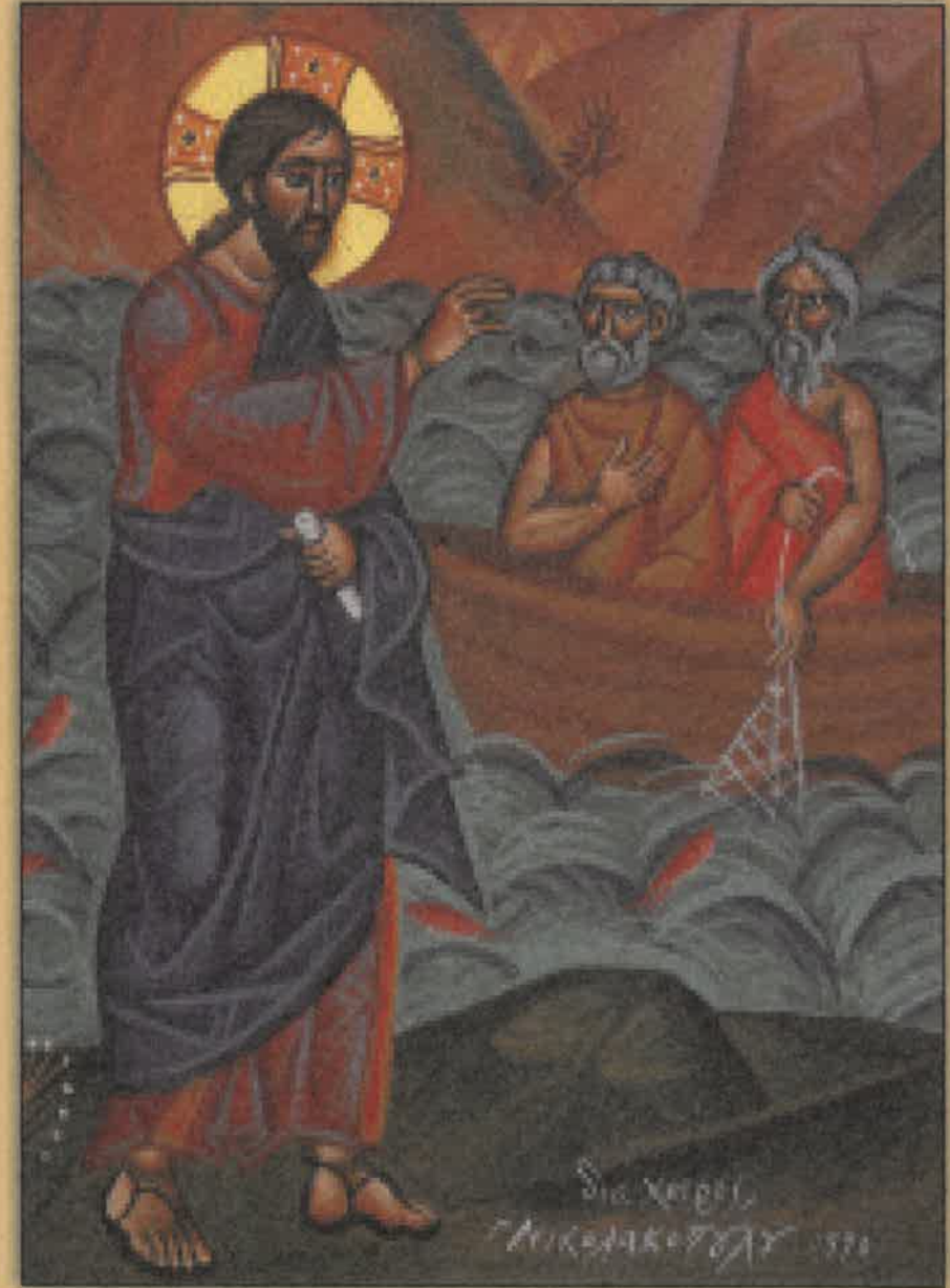
Icon of the Call of the Apostles (Luke 5:1-11)