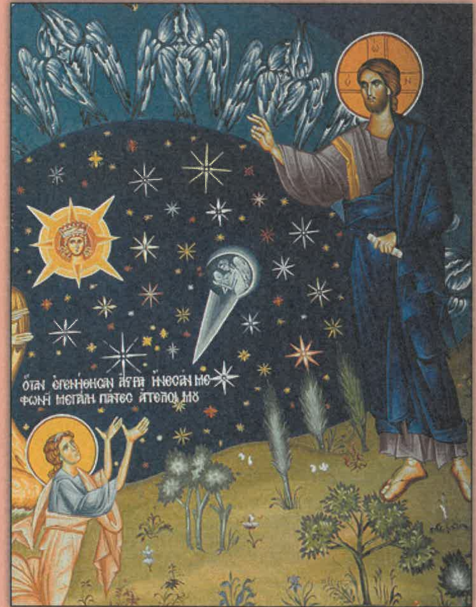
Icon of Creation