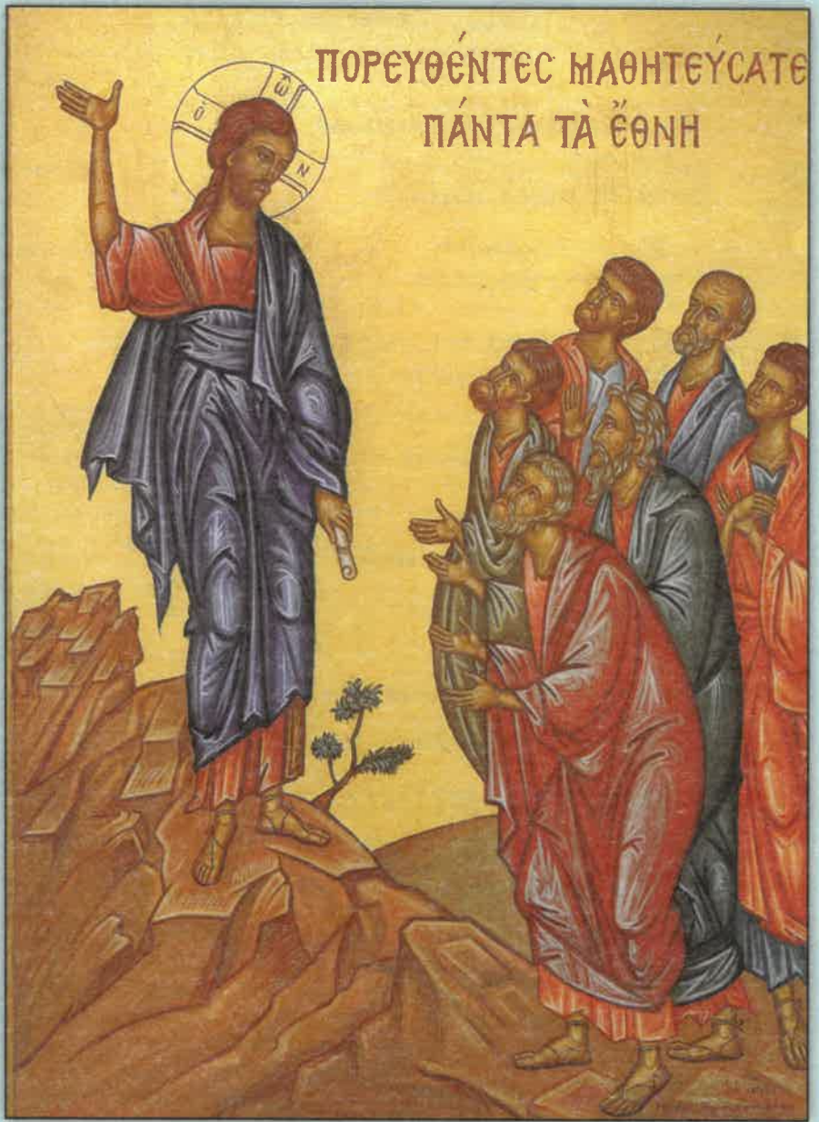
Icon of Jesus preaching to His Disciples