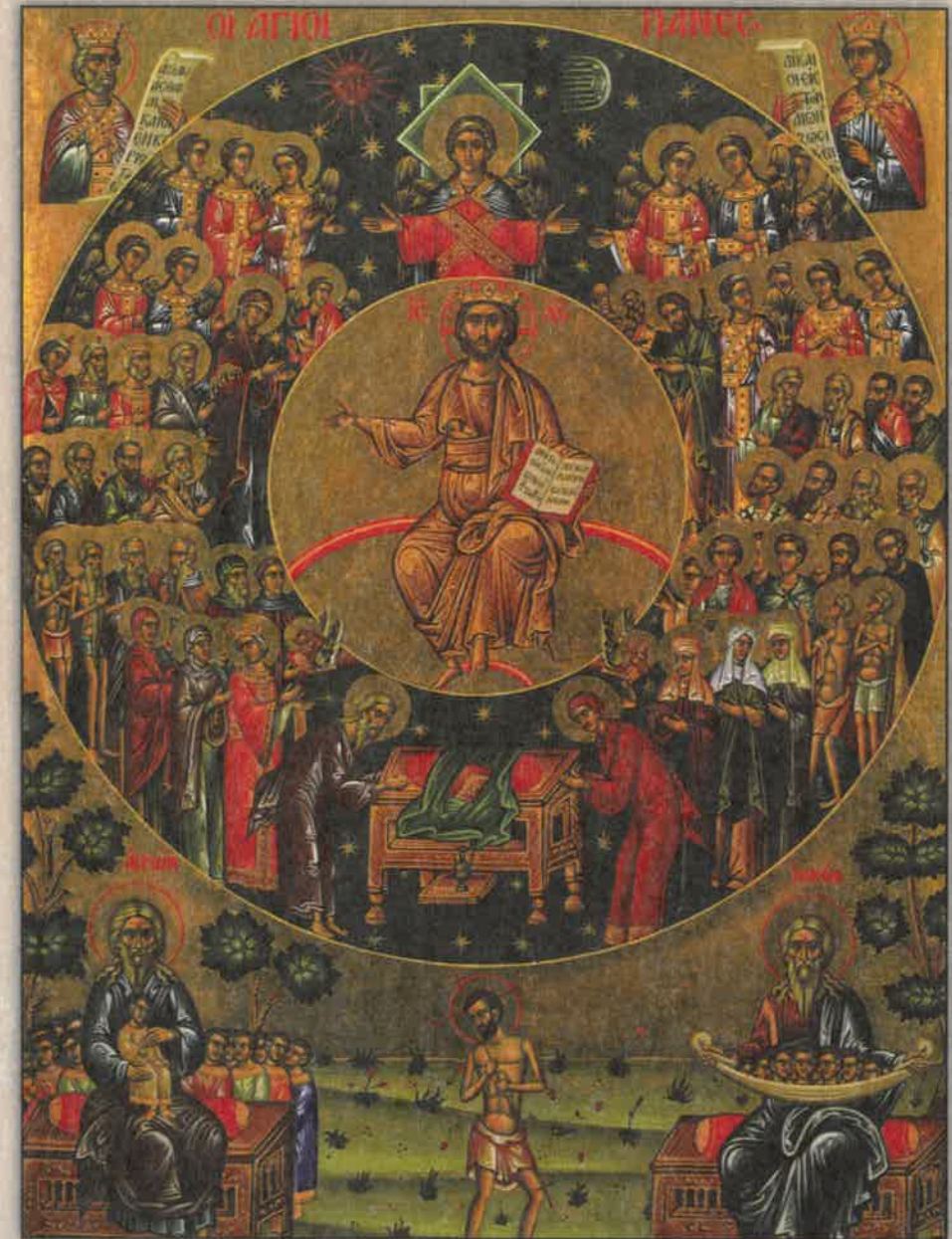
Icon of All Saints