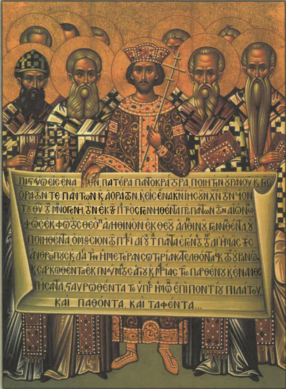
Icon of the Fathers of the First Ecumenical Council of Nicea