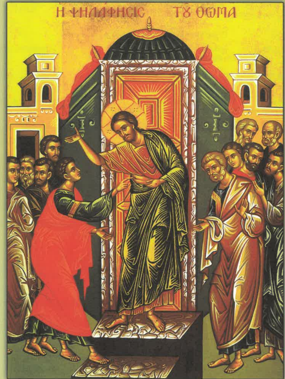
Icon of Saint Thomas and the Lord