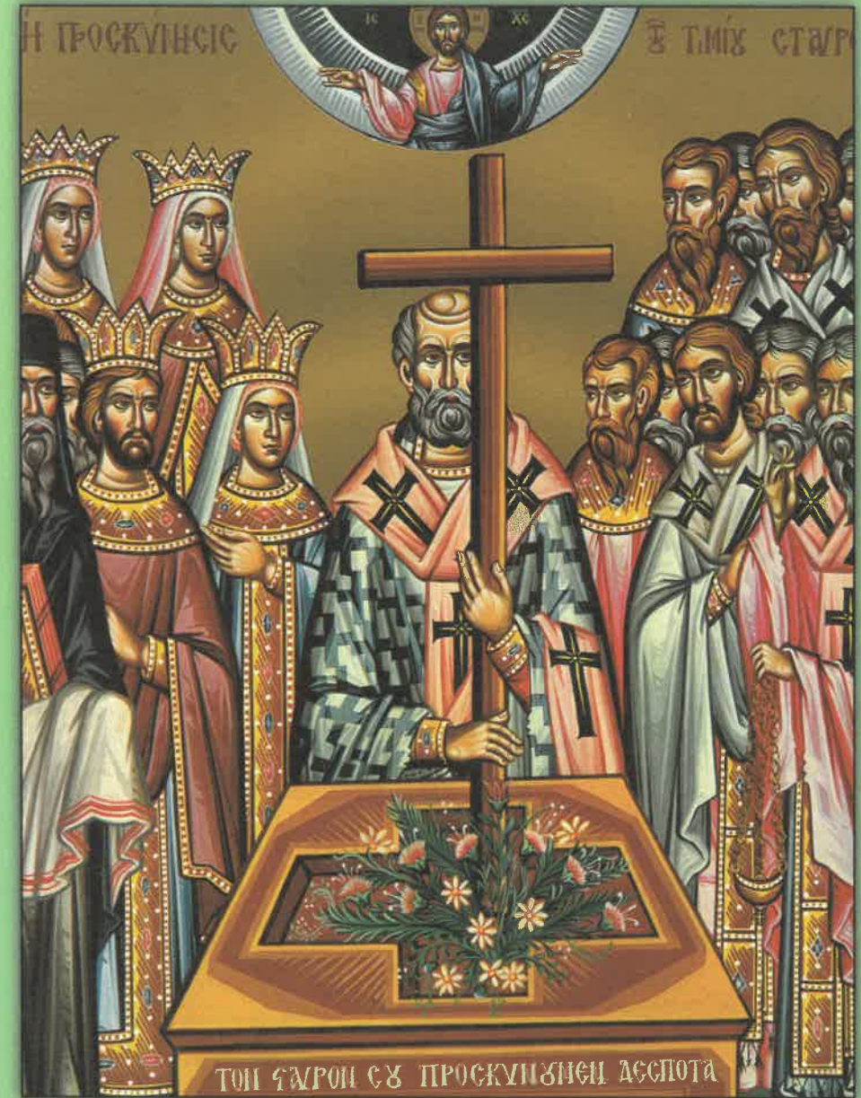
Icon of the Sunday of the Holy Cross