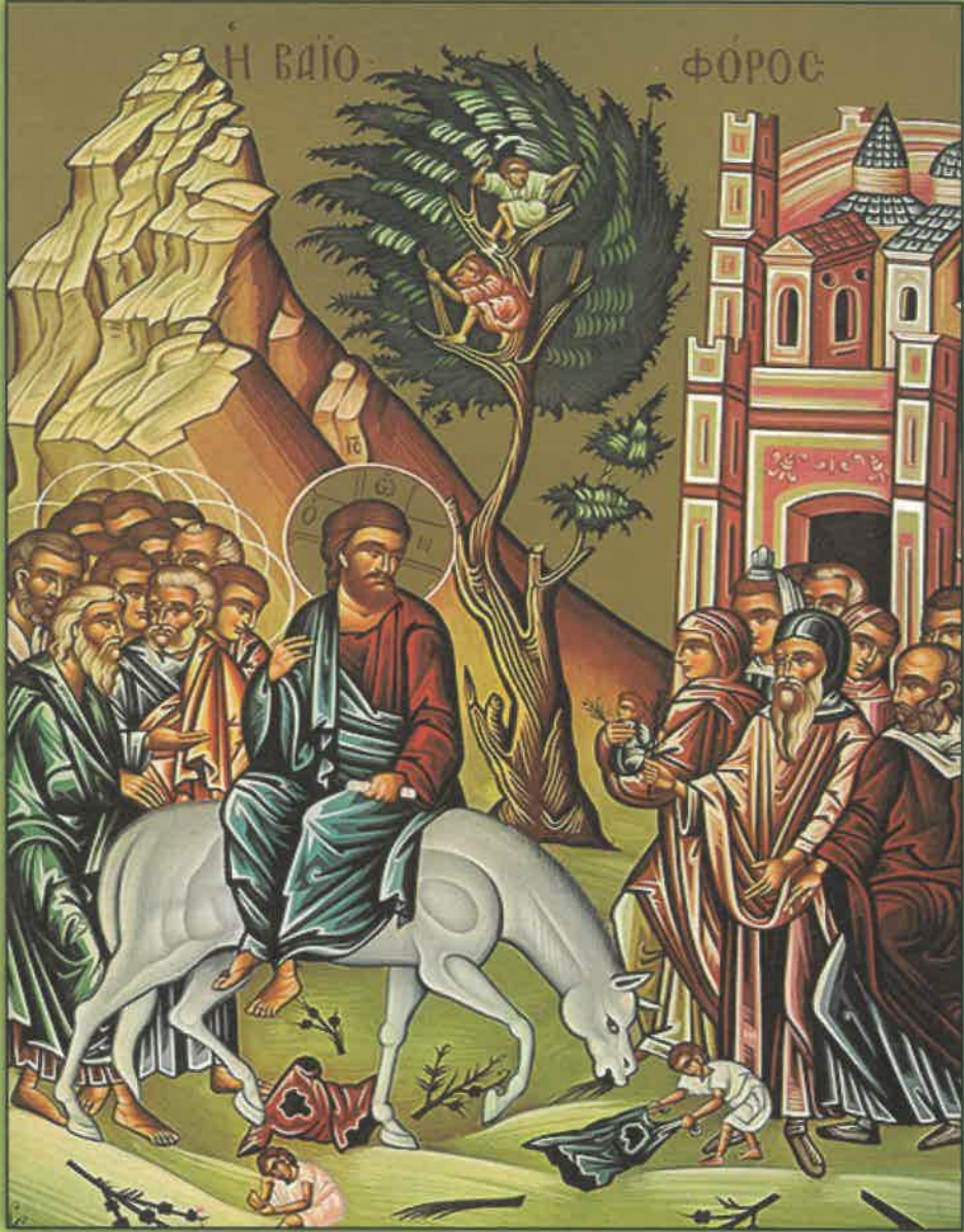
Icon of the Entrance into Jerusalem