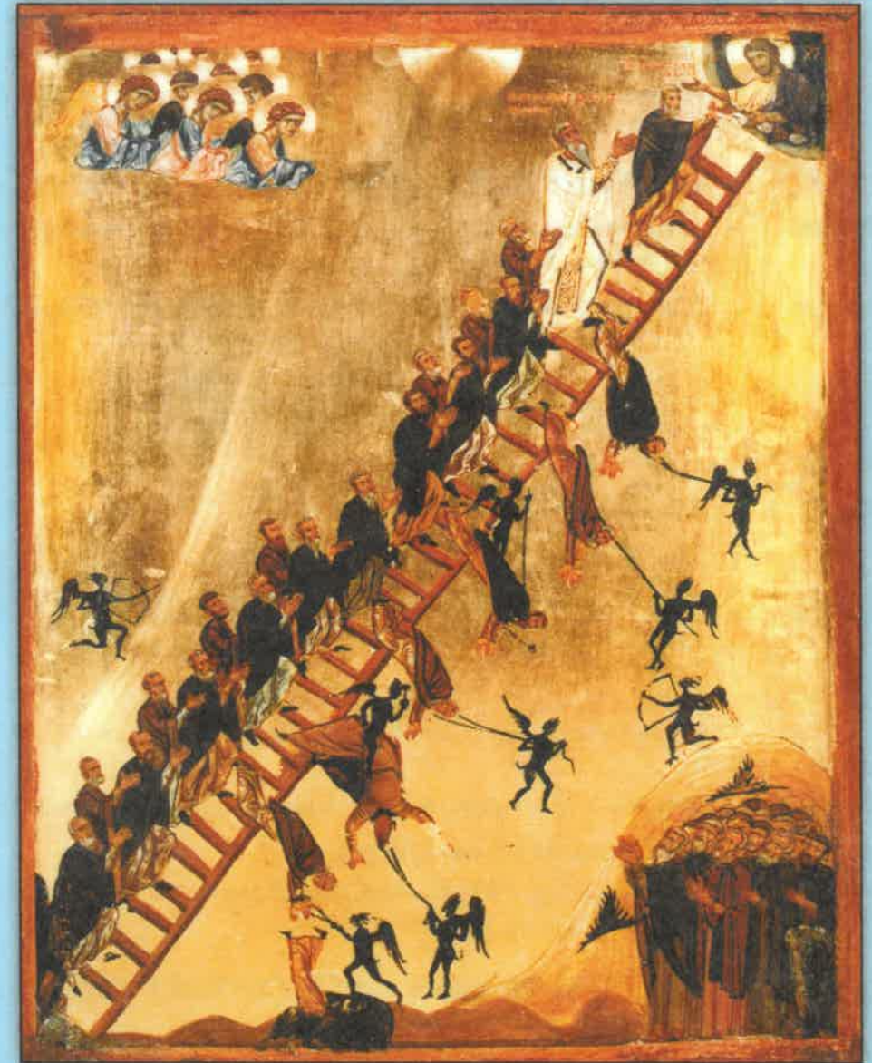
Icon of the the Ladder of Divine Ascent