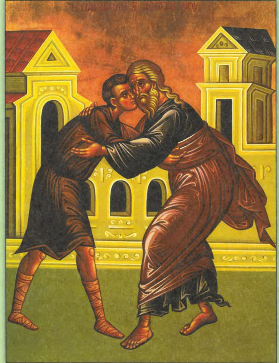
Icon of the Prodigal Son