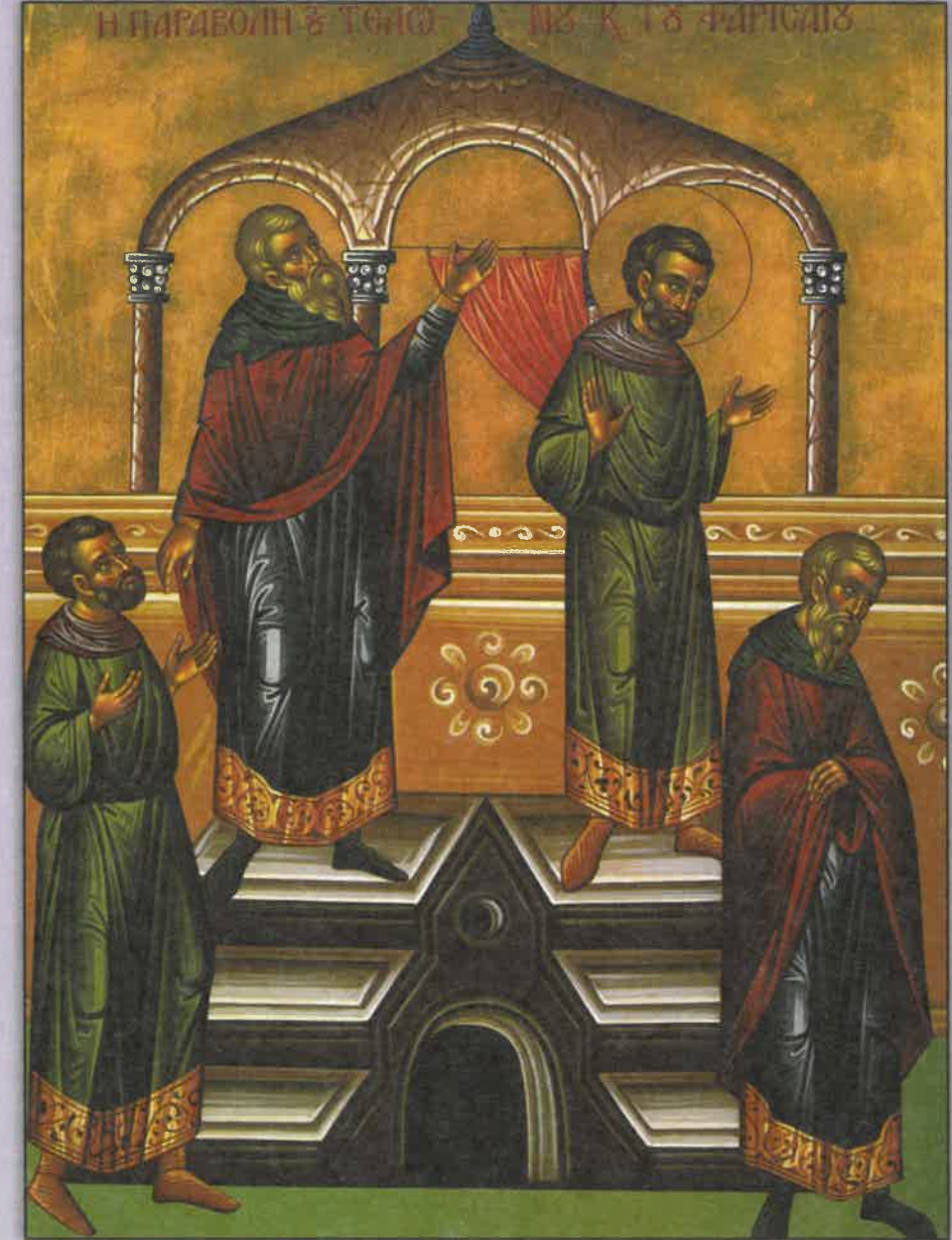
Icon of the Publican and Pharisee