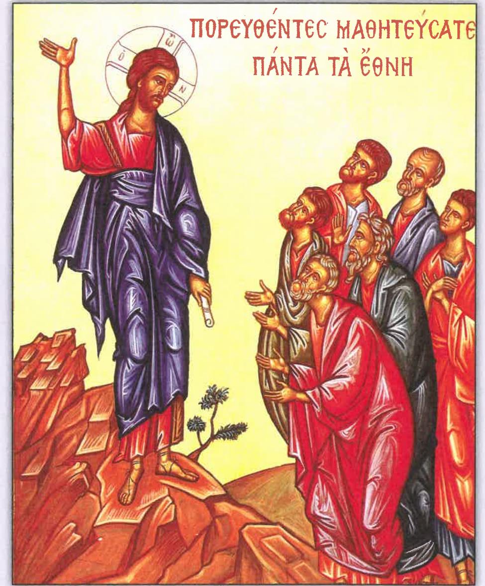
Icon of Christ Teaching the Apostles