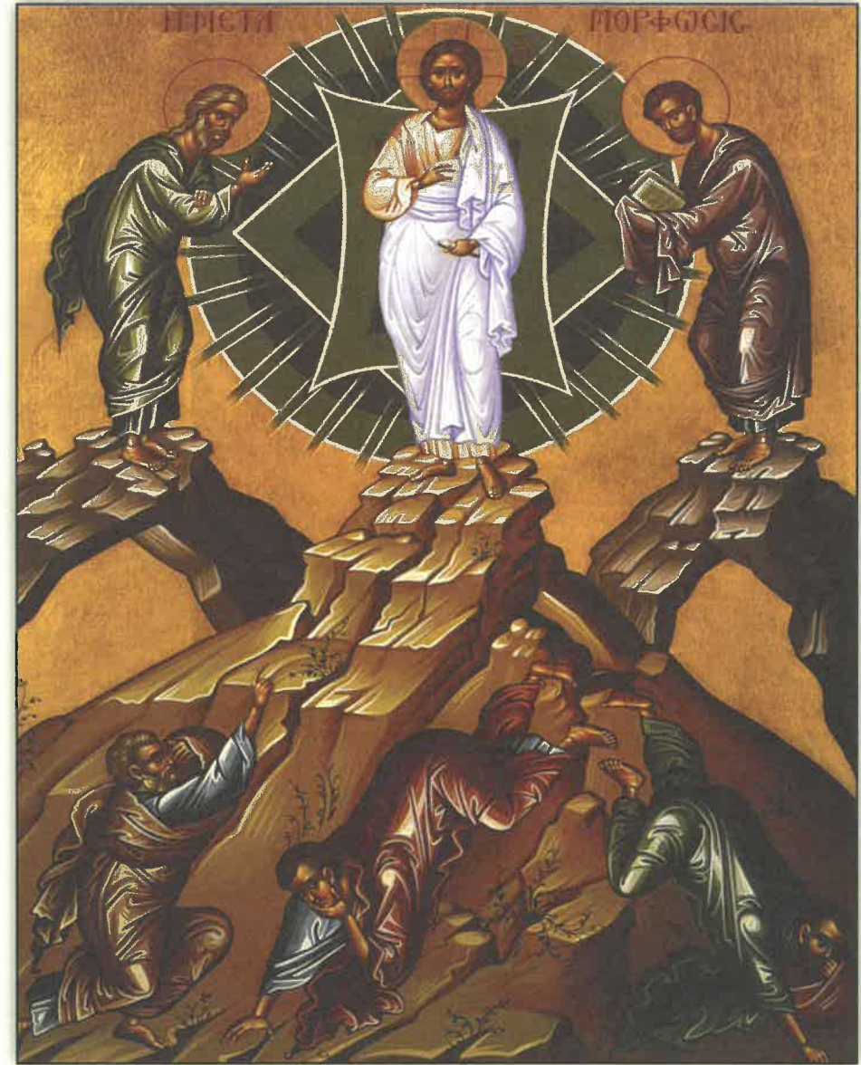
Icon of the Transfiguration of Our Lord