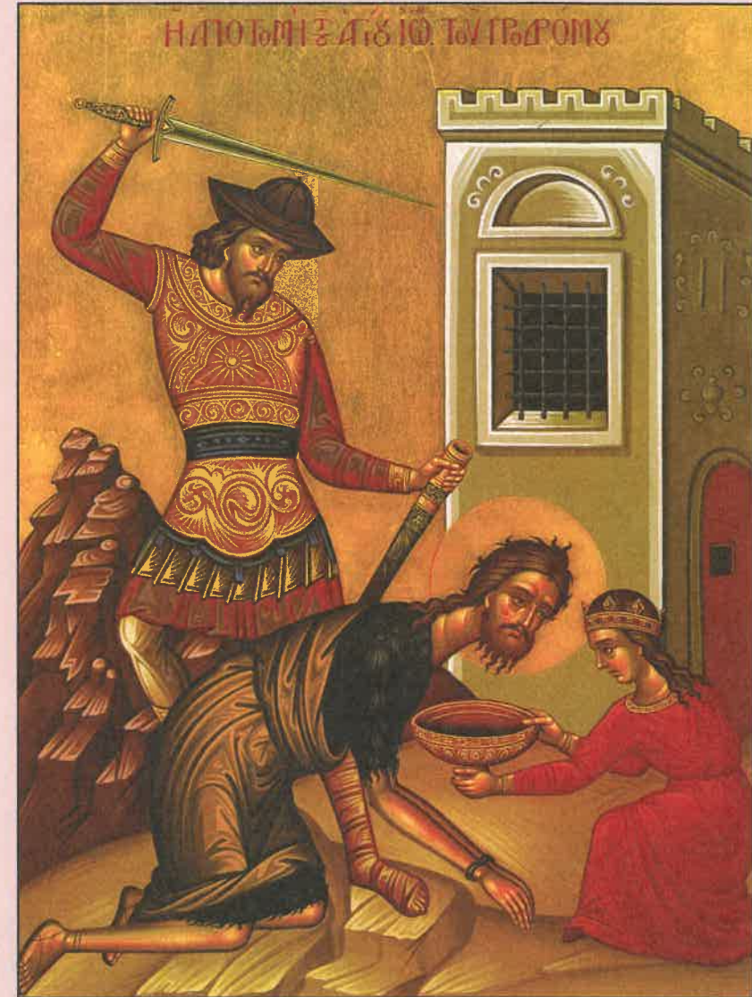
Icon of the Beheading of Saint John the Baptist -- August 29th