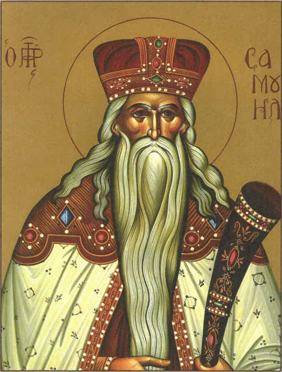
Icon of the Prophet Samuel — August 20th