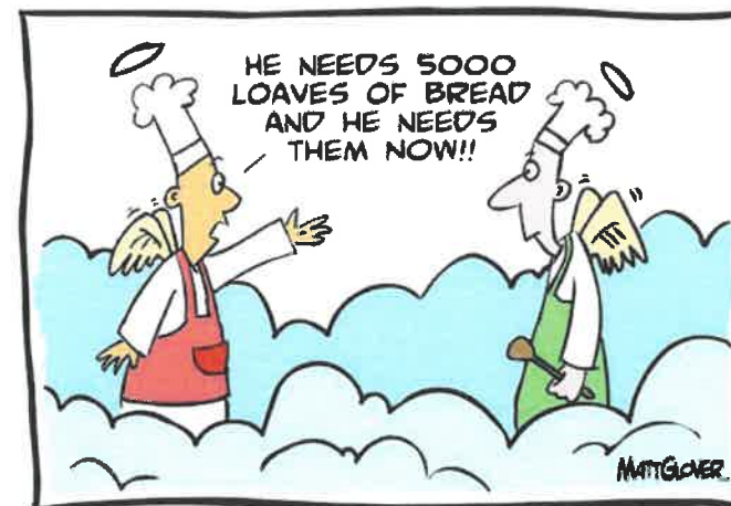
Panic stations in Heaven's bakery...