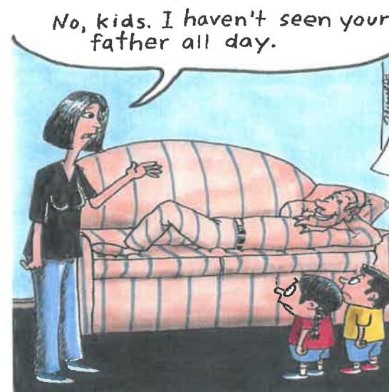
The new camouflage couch for dads is sweeping the nation.