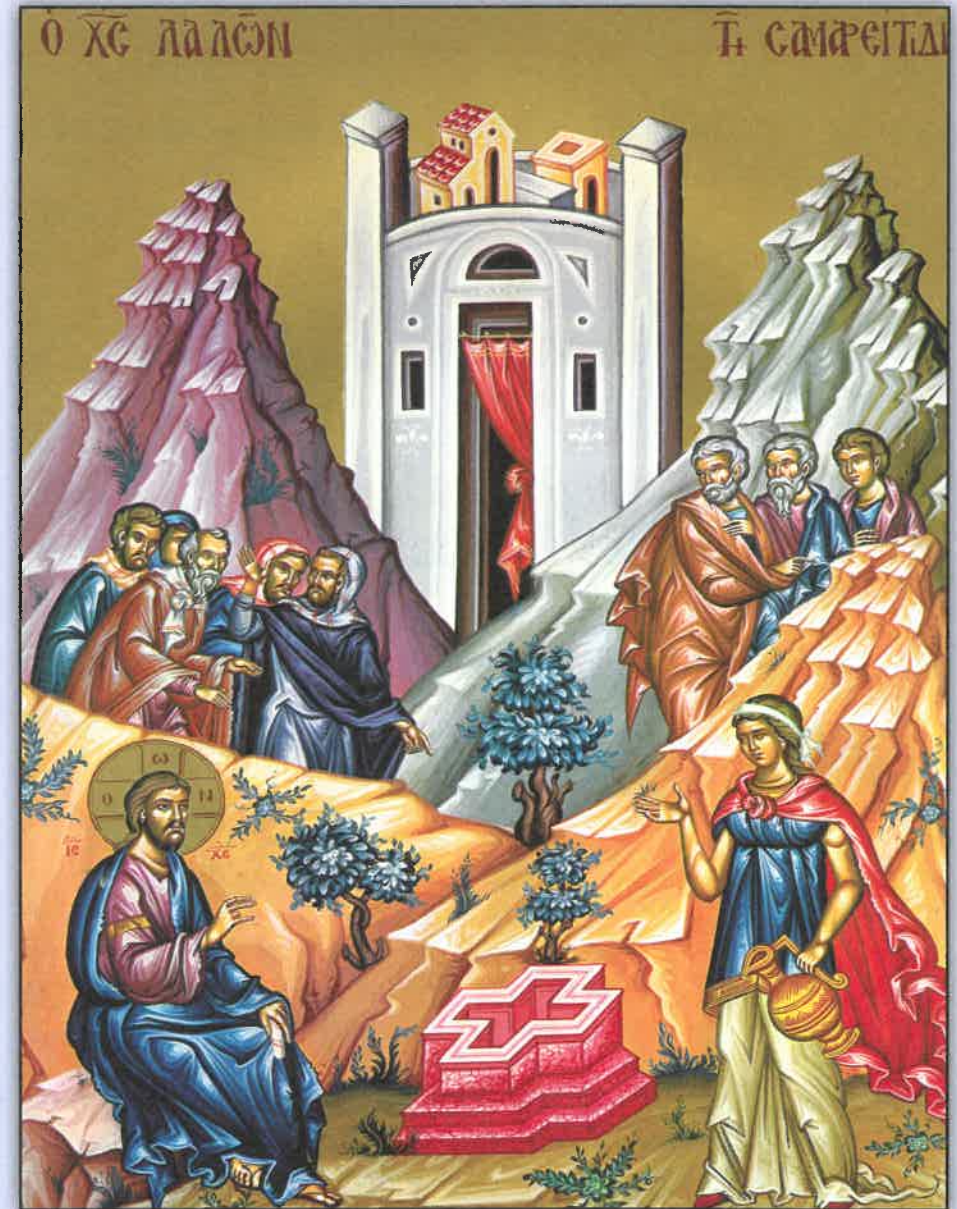
Icon of the Samaritan Woman