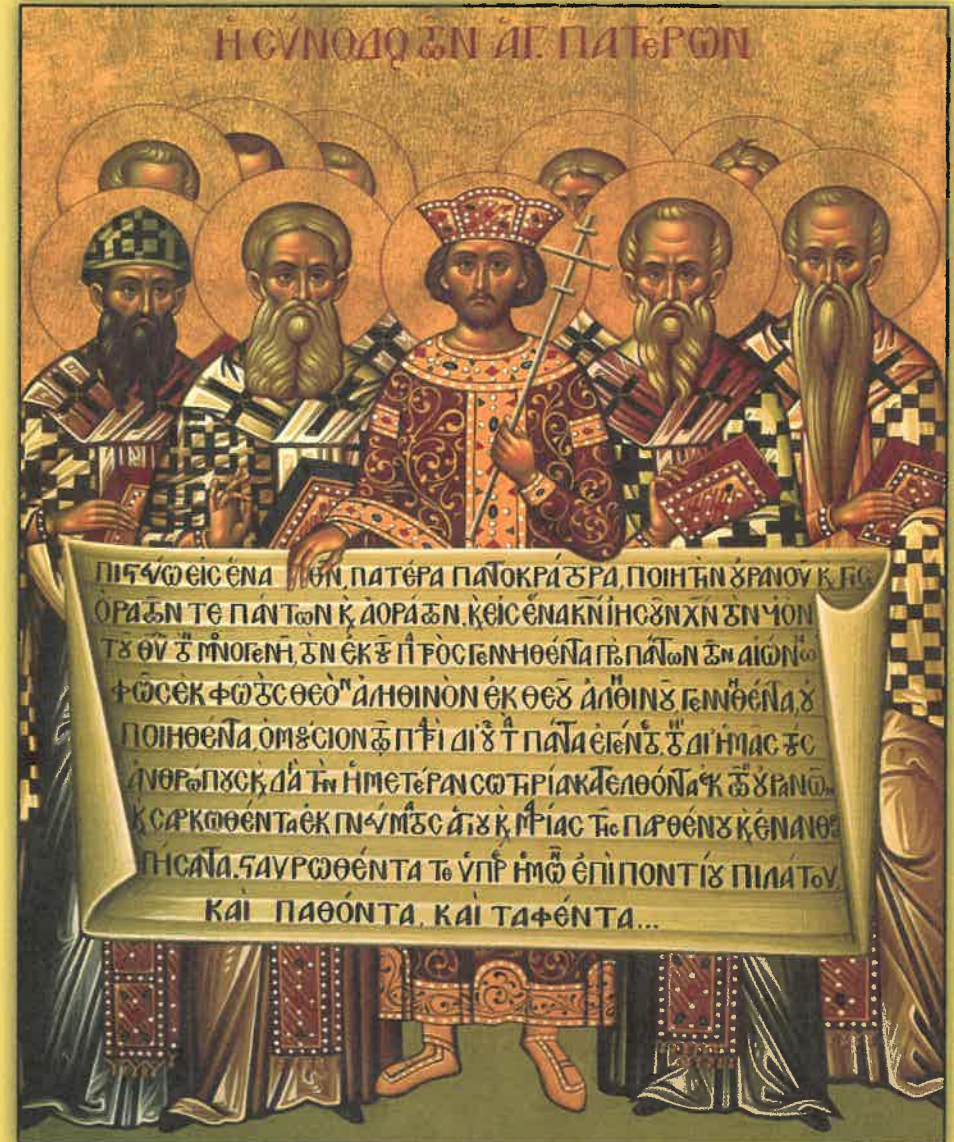
Icon of the Fathers of the First Ecumenical Council