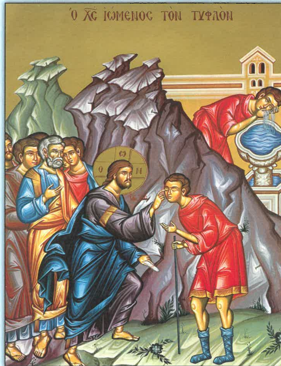
Icon of the Man Born Blind -- John 9:1-38