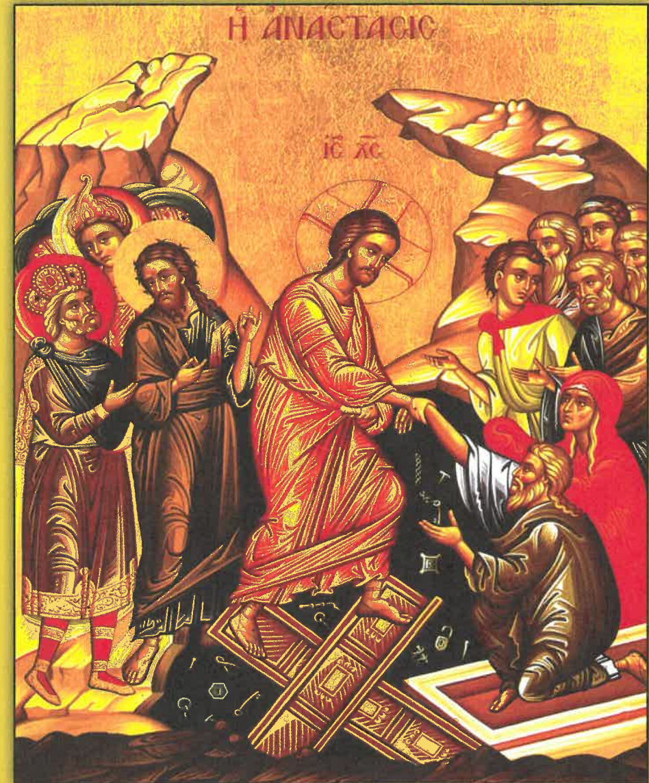
Icon of the Resurrection