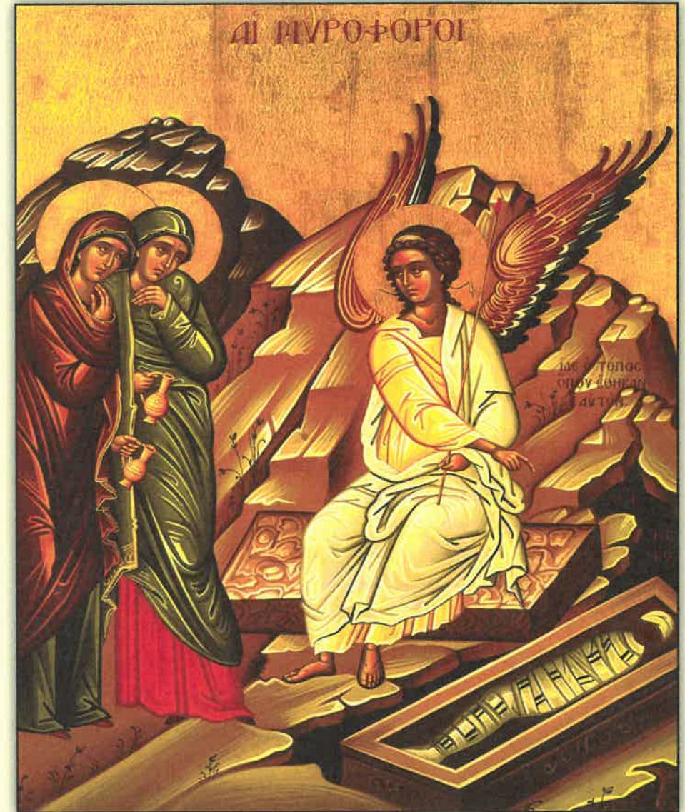
Icon of the Ointment-Bearing Women