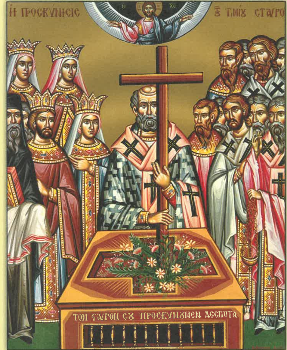
Icon of the Elevation of the Holy Cross