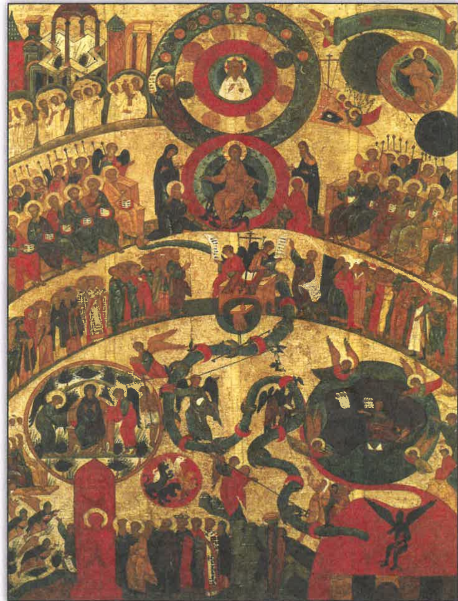
Icon of the Last Judgment