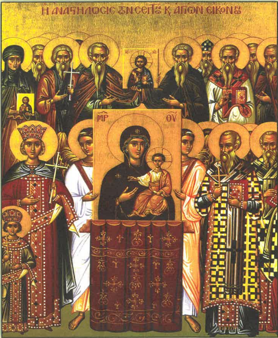
Icon of the Restoration of Holy Images