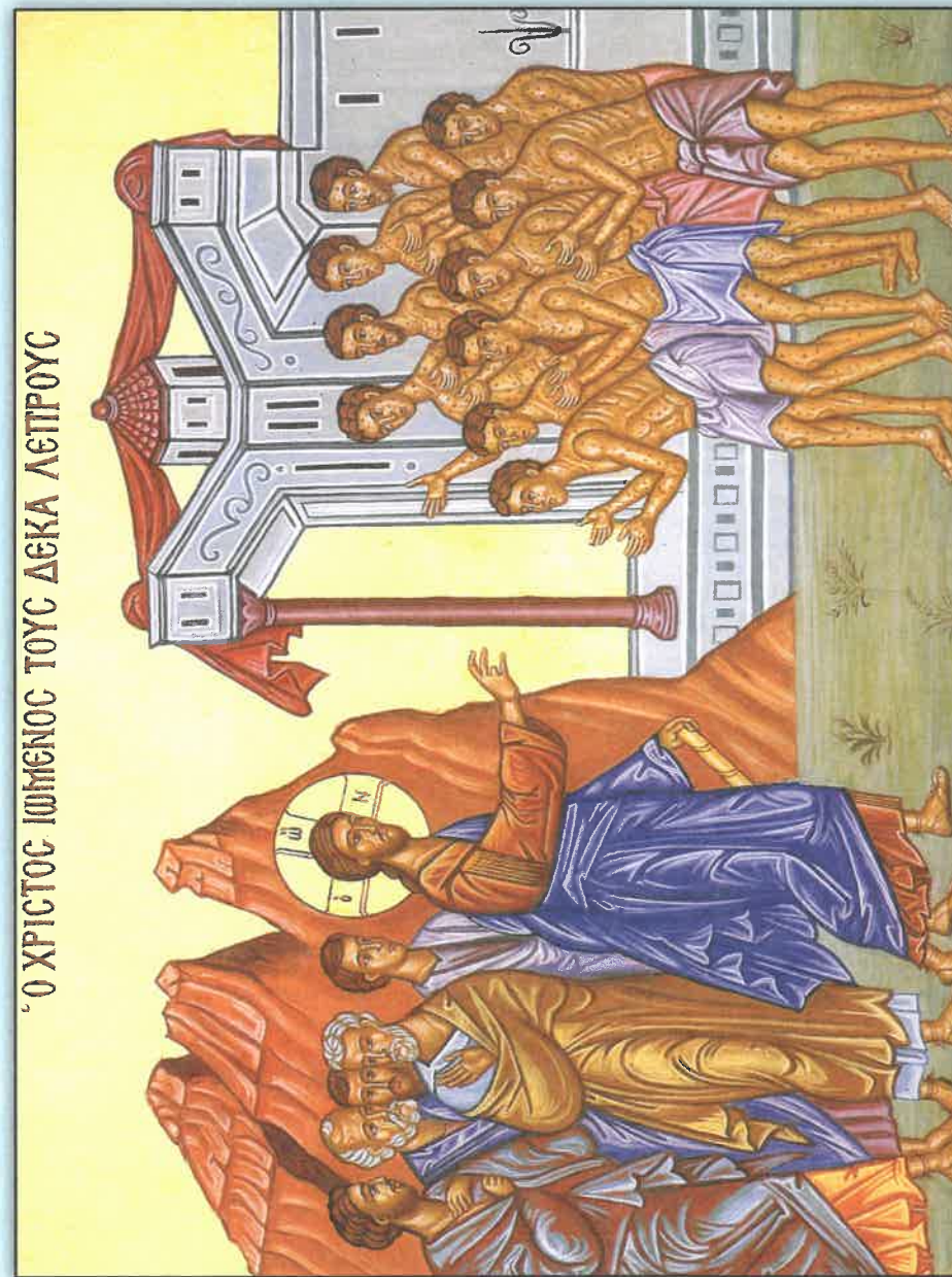
Icon of the Healing of the Ten Lepers (Luke 17:12-19)