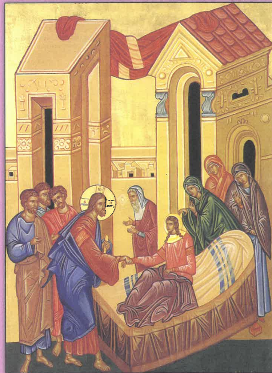
Icon of Raising the Daughter of Jairus