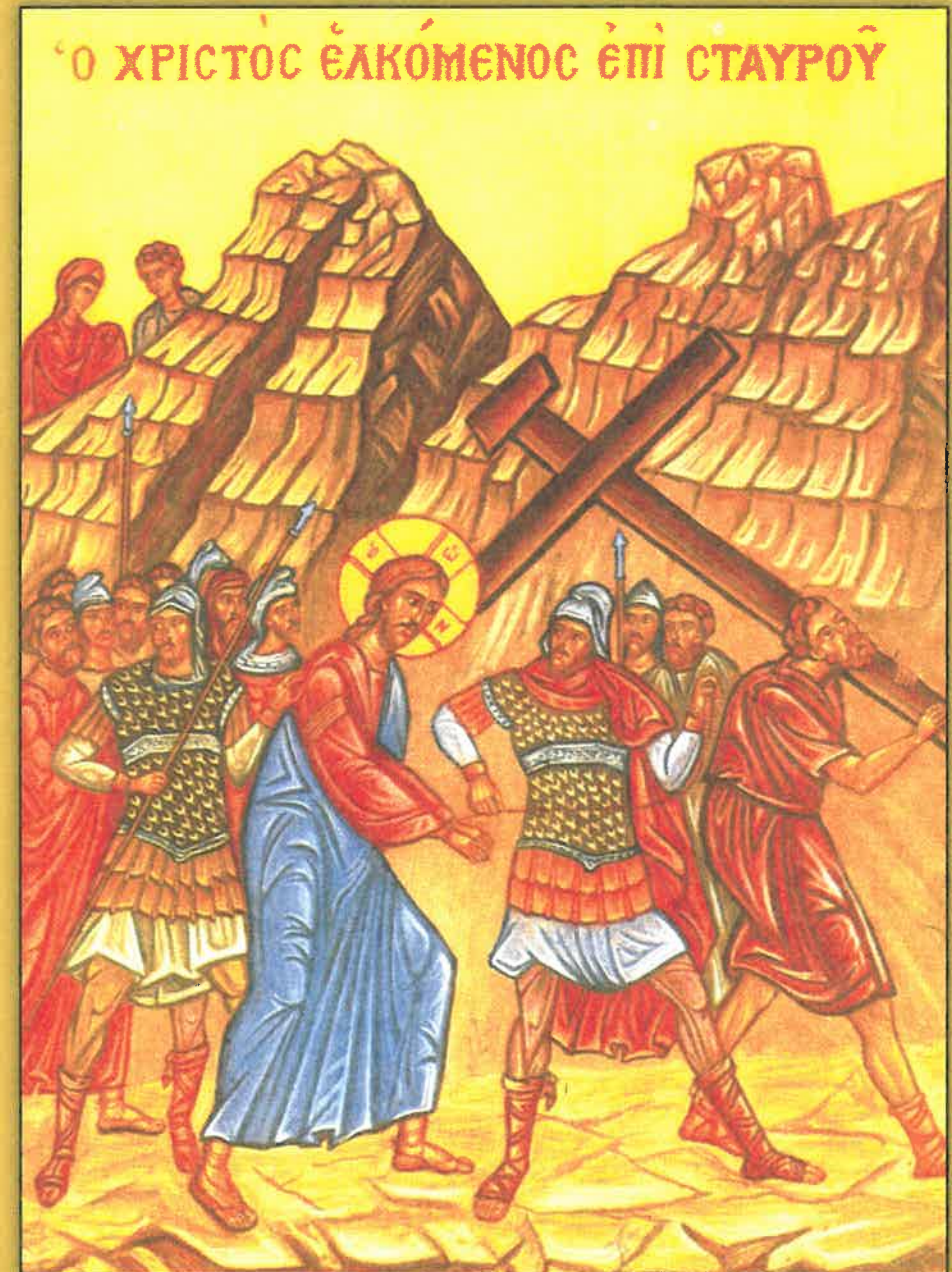
Icon of Simon Carrying the Cross of Christ