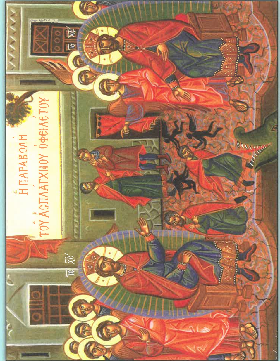
Icon of the Unforgiving Servant (Matthew 18:23-35)